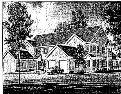
GrandeVille at Cascade Lake will feature 276 units.

GrandeVille at Cascade Lake is LeCesse's third venture in Minnesota. Grand Reserve at Eagle Valley in Woodbury, Minn., a 394-unit property, was completed in 1999. City Walk, also in Woodbury, includes 287 residential units, retail and office space. Weis Builders constructed both of LeCesse's earlier Minnesota projects.